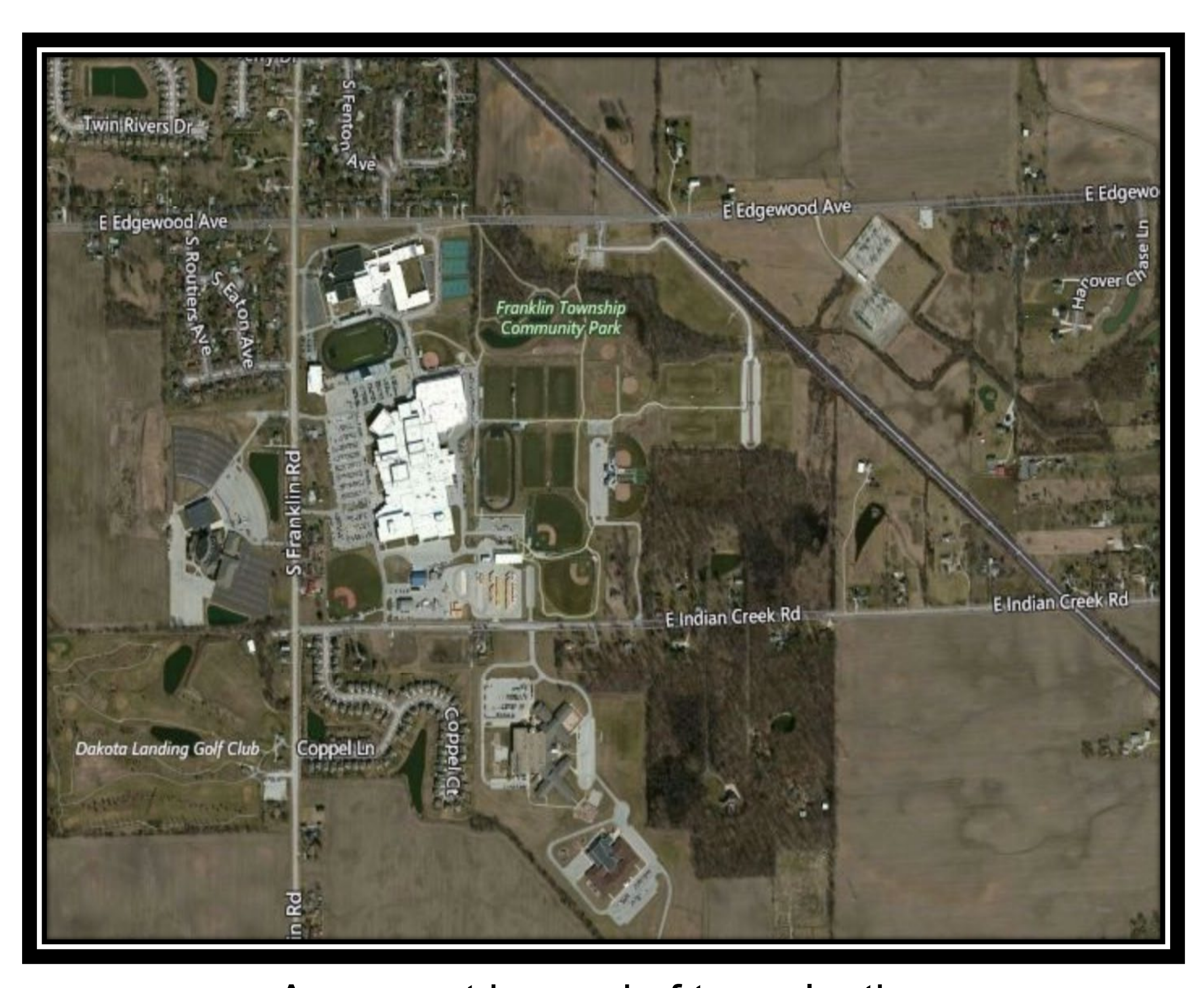
Area most in need of tree planting