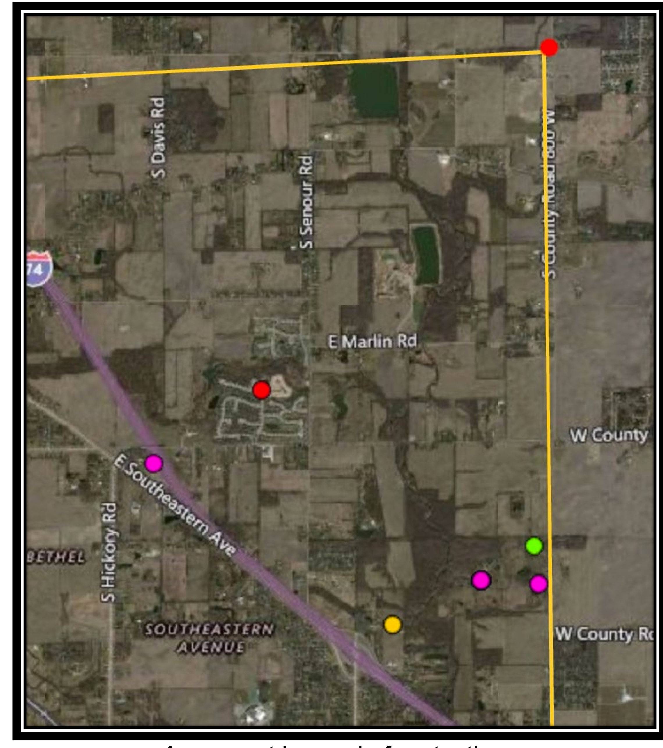
Area most in need of protection